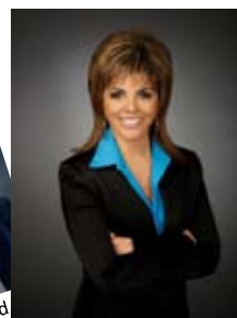
Jane Velez-Mitchell Host of "Issues" on HLN