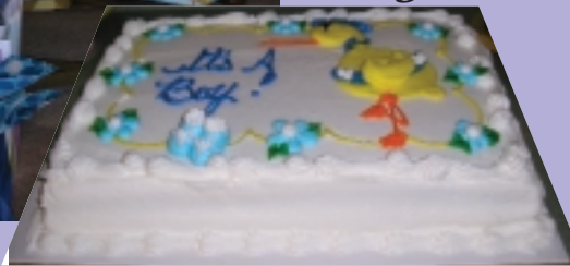
Goodies for the baby, and mommy.