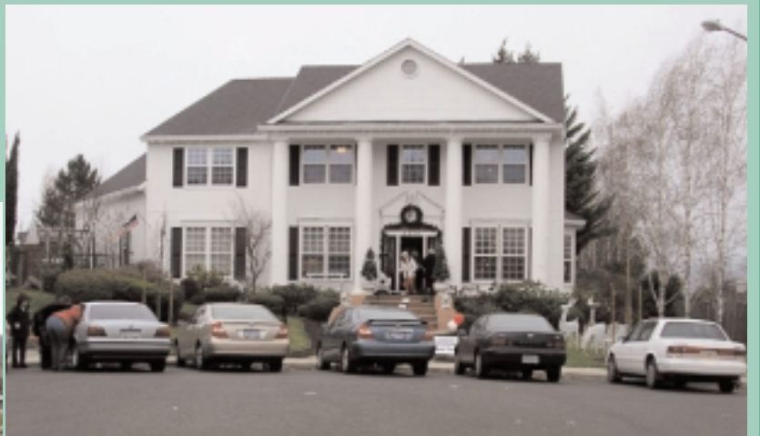
The house on Greystone Court...