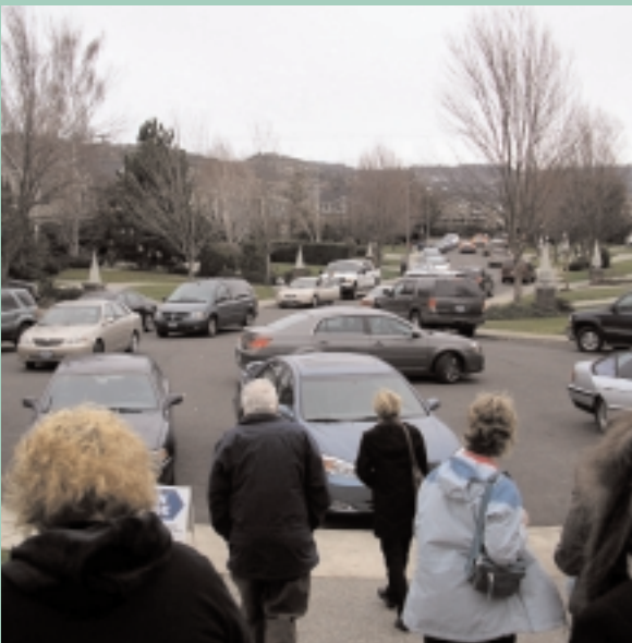
The house on Greystone Court was a huge attraction on this years tour.