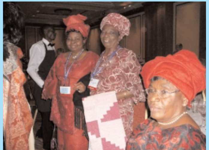
Soroptimist International delegates from Africa.