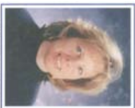
Each Office is Independently Owned And Operated.

Phone: (541) 878-3165 E-mail: mscapring@cdcrnet.net P.O. Box 1224 Shady Cove, Oregon 97539