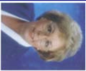
Each Office is Independently Owned And Operated.

Office (541) 855-2009 • 9351 Carolina Drive Fax (541-855-2009 • Central Point, OR 97502